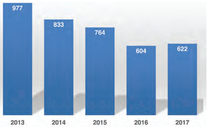
FIGURE 1 Immunizations Provided by North Shore Health Department, 2013-2017

Source: NSHD Performance Management System and Wisconsin Immunization Registry