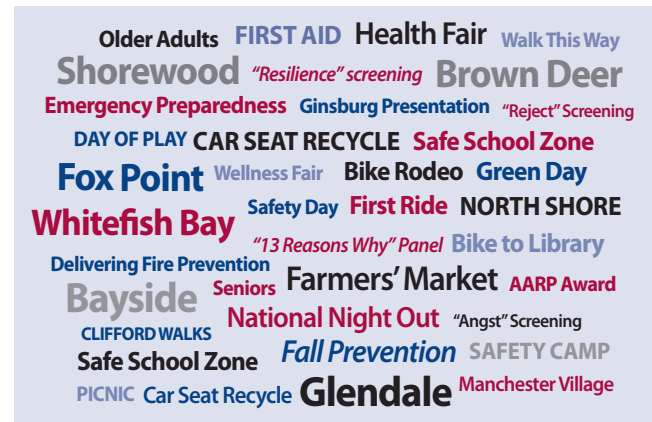
FIGURE 3 Sample of Community Events, 2017 North Shore Health Department

The NSHD’s environmental health program focuses on the assessment, management, control and prevention of environmental factors that may adversely affect the health, comfort, safety or well-being of our residents. The NSHD provides these services as part of Wisconsin State Statute, Chapter 254-Environmental Health.